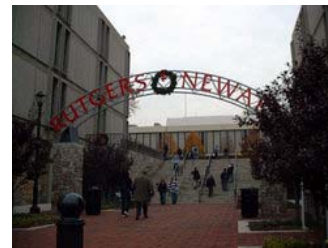
Rutgers-Newark campus, as seen from University Avenue.